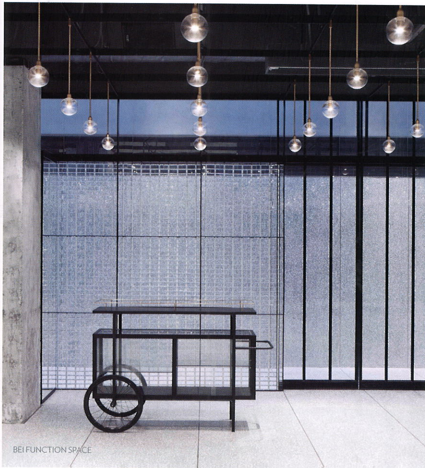
BEI FUNCTION SPACE

“PEOPLE ARE STUCK IN A PERIOD WHERE THEY’RE NOT ACCEPTING OF WHAT THE MODERN CONDITION IS”