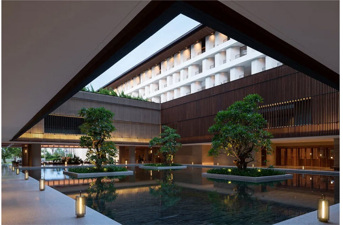
Openings above the lobby-level water courtyard frame views of the sky.

Constructed with masonry walls made from handmade clay bricks, the hotel's first level is a garden landscape with walls, ceilings, and openings strategically placed to take in specific sights. Lowered ceiling heights provide a human scale while directing guests toward the punched-through sections that open up to a great expanse of sky. Instead of having one large, continuous lobby, the design team opted to fill the in-between spaces with ponds, lining them up with openings for a poetic connection of elements. “We borrowed landscape by using the architecture to frame views,” Neri says. “In the public realm, there isn’t a view of the beach, so we created an aperture to the sky above the ponds. Every time you encounter water, you will also see sky.”