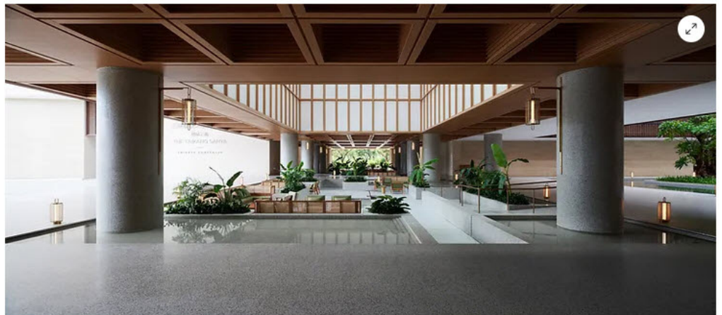
The Sanya Wellness Retreat, designed by Neri&Hu Design and Research Office, is located on China's Hainan Island. Granite floors and teak details act as a unifying palette throughout the property.

Located on China's Hainan Island and designed by Neri&Hu, this contemporary hotel and spa uses architectural forms to capture views of sea and sky.