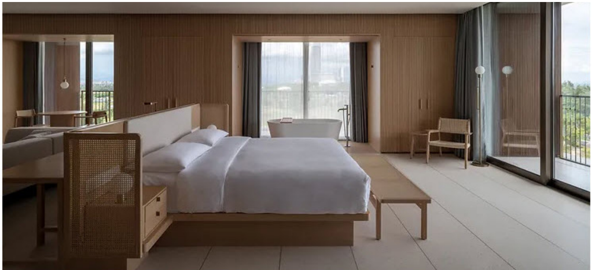
The rooms at Sanya Wellness Retreat are minimal and elegant, with custom furniture designed by Ner&Hu.