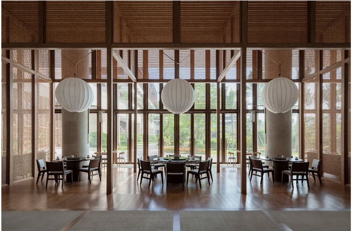
Weather-resistant teak and granite are the two main materials seen throughout the property.