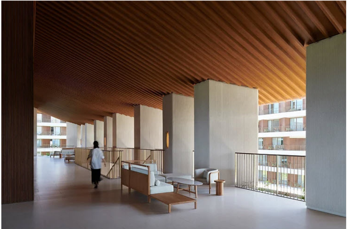
Wide breezeways outside of guest rooms help facilitate air flow and encourage mingling.

Turning to local craftsmanship, Neri&Hu opted for masonry walls clad with handmade clay bricks and granite flooring. Teak wood details abound—the wood softens the appearance of the predominantly brick boxes and is highly weather-resistant, an optimal choice for tropical seaside construction. Elsewhere in the resort—the lobby, guest rooms, restaurants—woven rattan appears, “woven rattan appears, while other areas tap into the ancient technique of soaking and pressing bamboo for construction material.