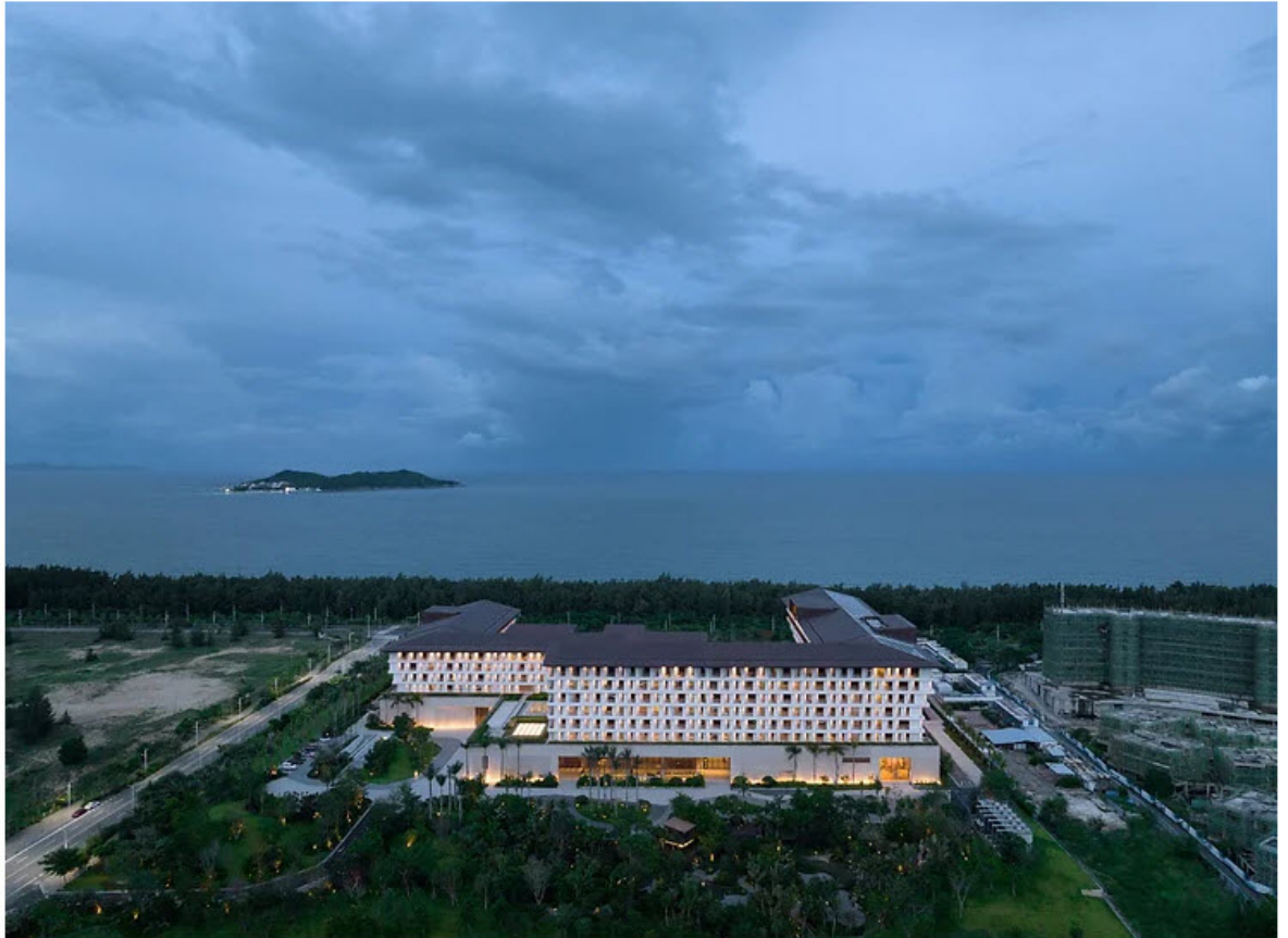
The resort is set back from the ocean, so the architects elevated the guest rooms to take advantage of the views.

“There were several considerations we had to keep in mind,” Neri says of the design. “The lot is set back from the beach, so the building needed to be elevated in order to view the water. Also, the clients aren’t typical resort owners—they own a large network of homes for elderly people. Because of this, our design needed to accommodate a range of needs from young children to those of much older people. We had to ensure it had everything from ramps and high railings to corridors with super-wide, five-foot turning radiuses. As a firm, we decided to celebrate these features without making it look like a requirement.”