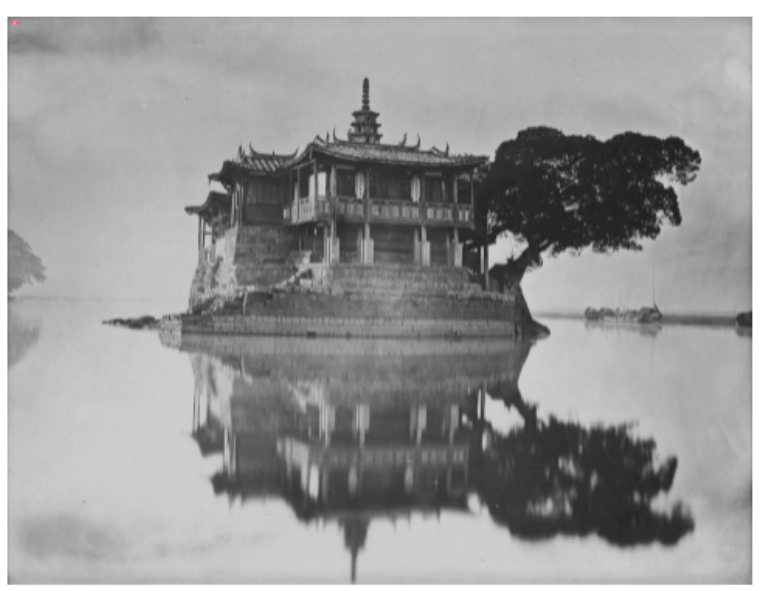
Fuzhou's Jinshan Temple documented by John Thomson in 1871

Along the building's periphery runs 'a sliver of continuous illumination' created as a result of elevating the metal roof 50 cm above its base via copper clad trusses.