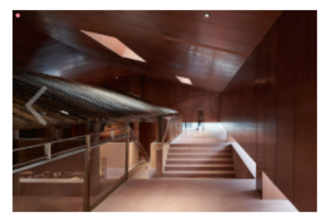
The mezzanine floor

At the entrance, a meandering dark grey terrazzo path criss-crosses the area around a reflecting pool, and it leads to the main double height hall where the former wooden pillars have been restored to give space to a dedicated seating area, copper-meshed screens, penetrating sky wells and open and wide alleys. At every nook and corner, several apertures and inconspicuous openings blur the boundaries between indoor-outdoor space where light filters through these miniature and massive cracks of the structure's skin to create stunning silhouettes and reflections on the exposed wooden surfaces.