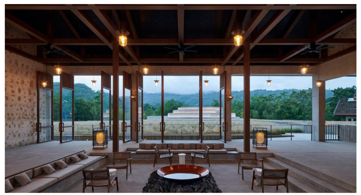
The buildings are dominated by concrete and stone

Neri&Hu organised the dining space around the building's edges, while an open-air courtyard at its centre is oriented to frame Mount Emei.