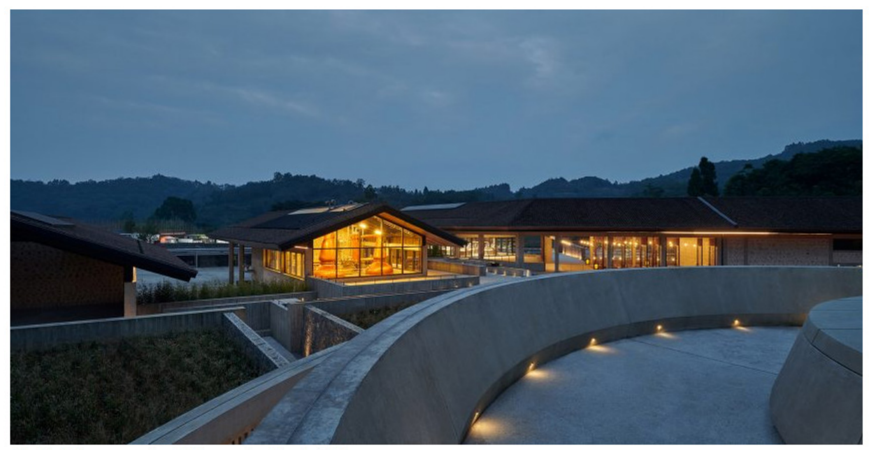
The buildings contain whisky production facilities

According to the studio, its design celebrates its rural setting and represents "the Chinese notion of the duality of natural elements, which make up the world we live in".