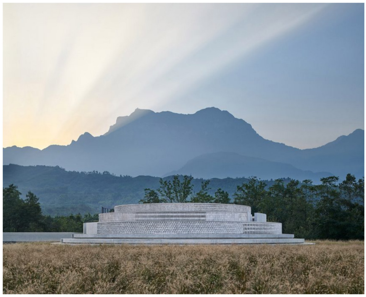
An underground experience centre is capped by a sculptural brick platform

Shan-Shui's facilities include whisky production areas, which are contained within three long buildings on the north side of the site.