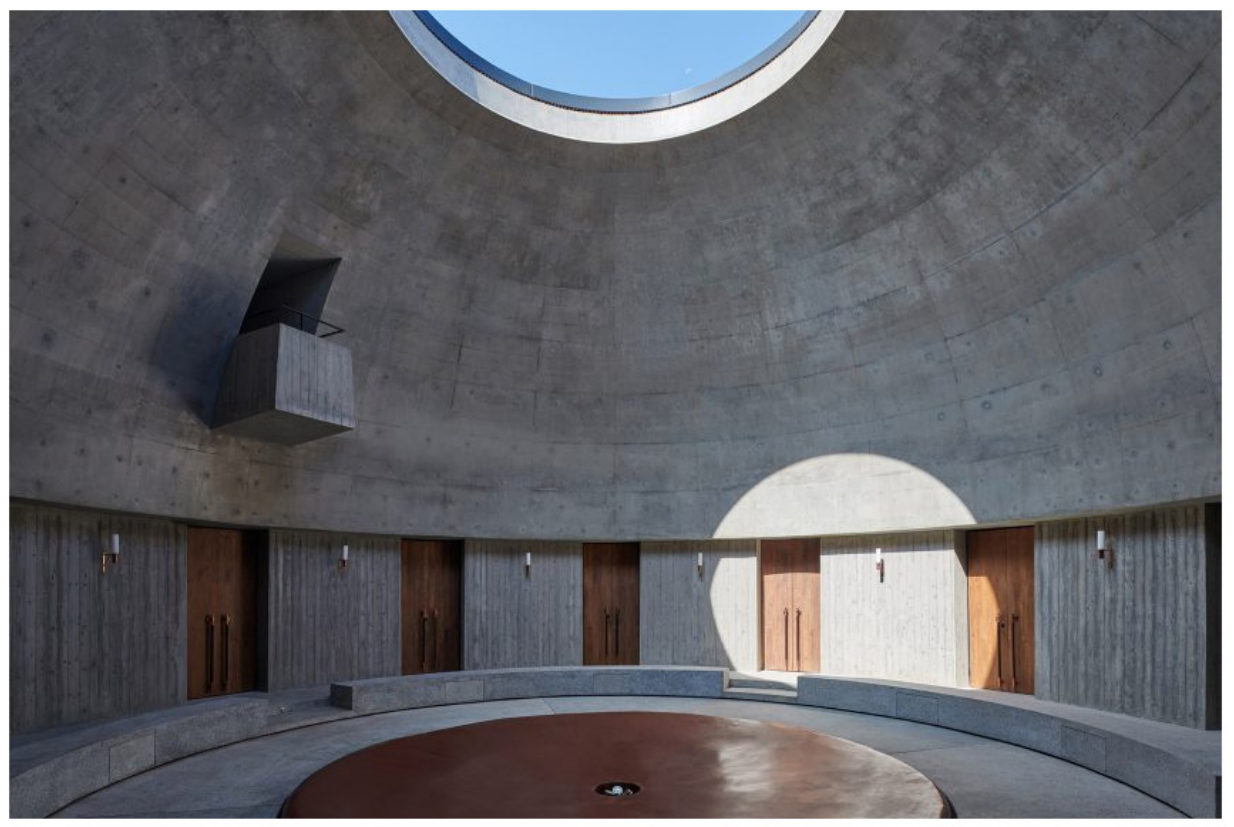
The underground experience centre has a domed atrium

The distillery also incorporates two visitor experience buildings – one circular and the other square-shaped.