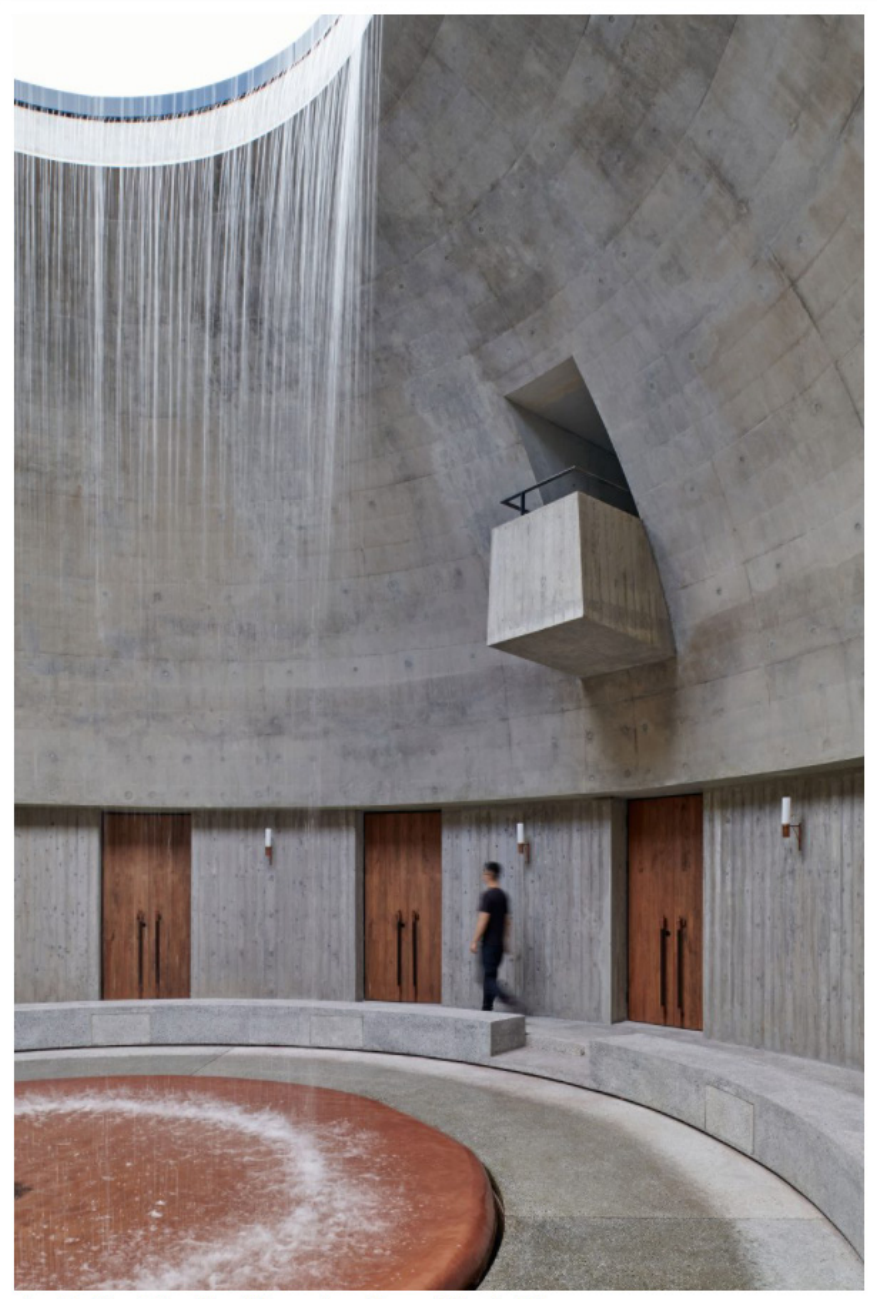
A water fountain sits at the centre of one visitor building

Above ground, this building resembles a sculpture composed of three concentric brick rings, which act as a platform for visitors to enjoy a panoramic vista of the site.