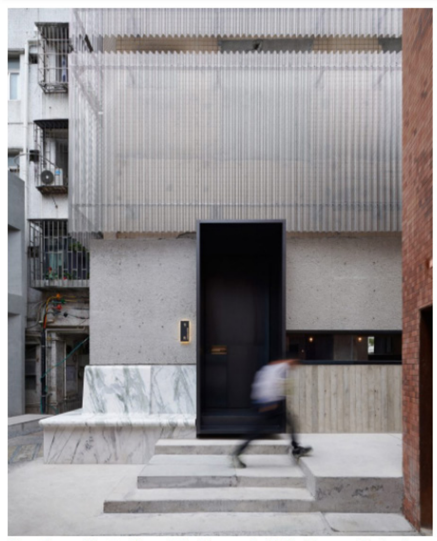
The entrance of the guesthouse is directly connected to the alleyways of the local neighbourhood

The Shanghai-based studio aimed to reflect the cultural heritage of buildings in the Nantou City urban village within its design for the guesthouse.