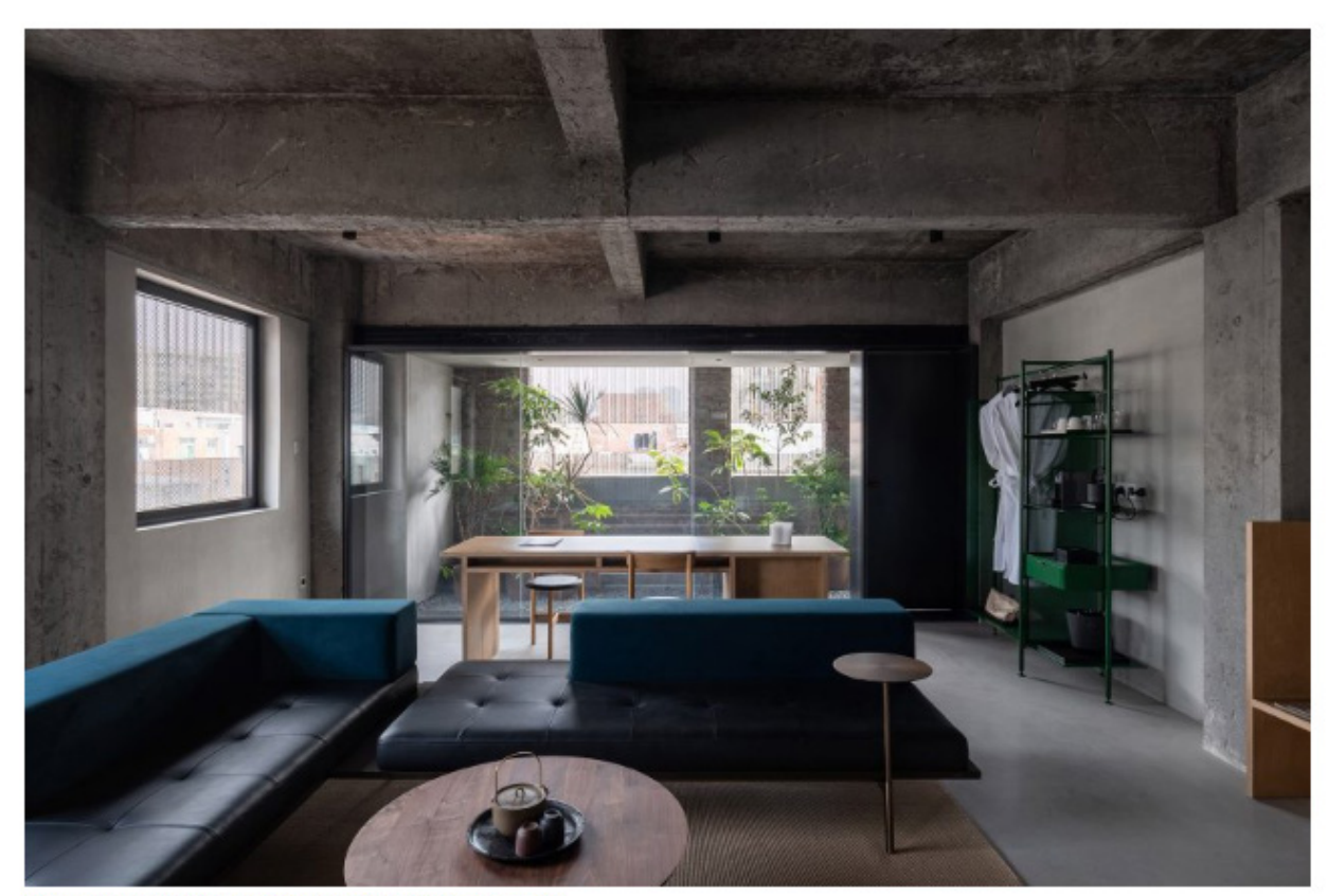
All rooms are designed differently with unique view

It was clad in a light steel screen-like cladding that gives the building a modern appearance while letting natural light into the building.