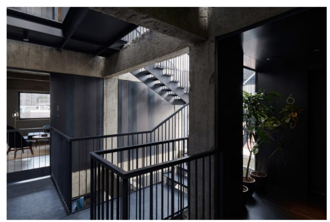
Neri&Hu inserted a new metal stairwell into the old structure

Existing, exposed structural elements were combined with modern additions throughout the building.