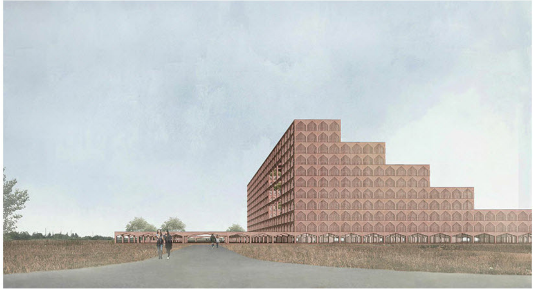
an array of repetitive structural elements are built of red concrete