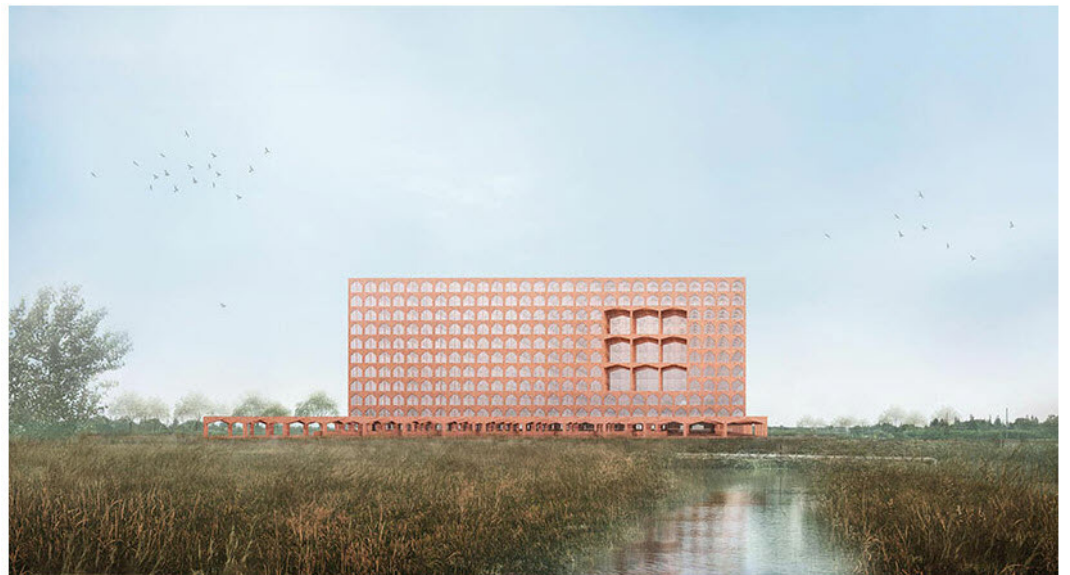
the structure reaches a height of ten stories