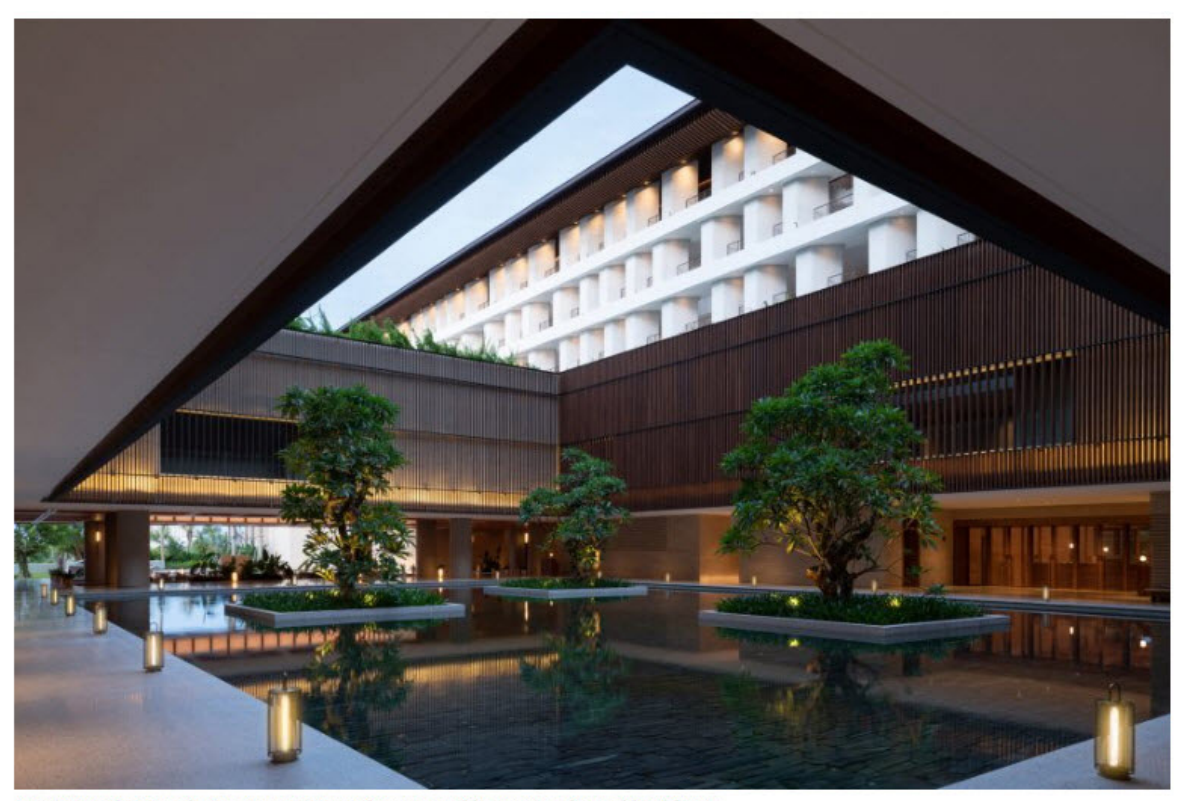
Neri&Hu designed a "water courtyard" wrapped by two L-shaped buildings

"At every given opportunity the design tries to embody the genius loci of Hainan, to blend elements from the island's collective memory, culture and natural features," said Neri&Hu.