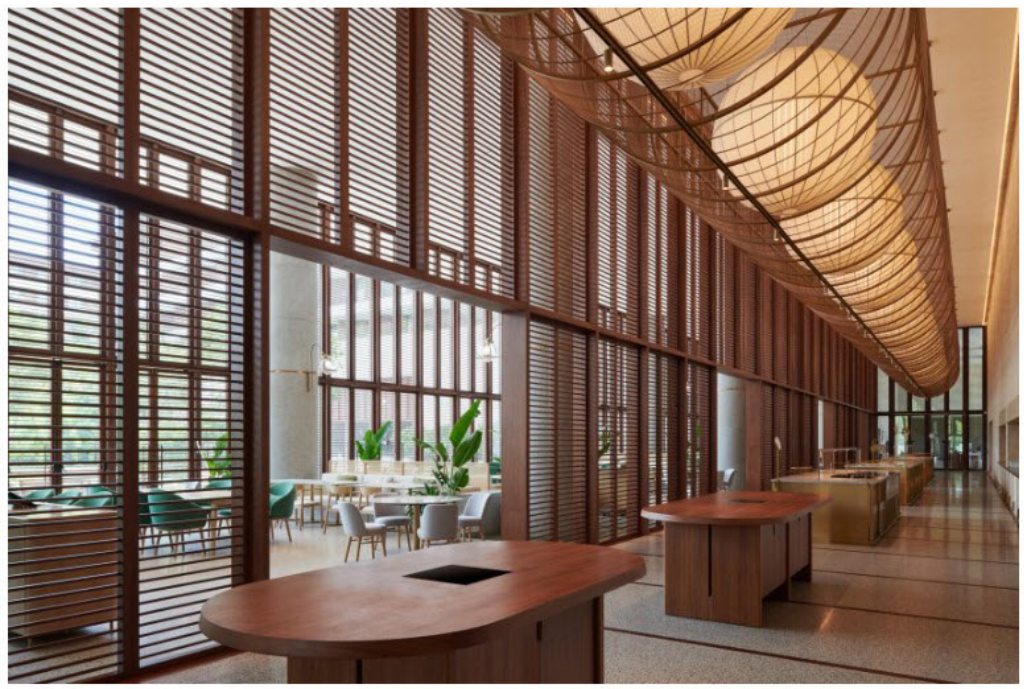
Woven rattan and bamboo surfaces add warmth to the interior

"The alternating rhythm between solid and void, the angled walls and textured material expression, all contribute to a dynamic facade that is constantly playing with light and shadow," said Neri&Hu.