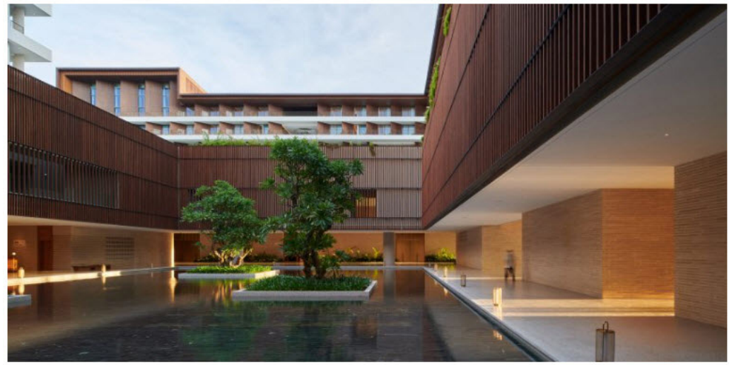
Public spaces were arranged around the courtyard

"The lobby becomes a garden landscape with a floating lantern hovering above that allows a gentle light to filter in, and with the soft breeze that flows through, guests are immediately transported to a relaxed state of mind for appreciating the slow pace of island life," said Neri&Hu.