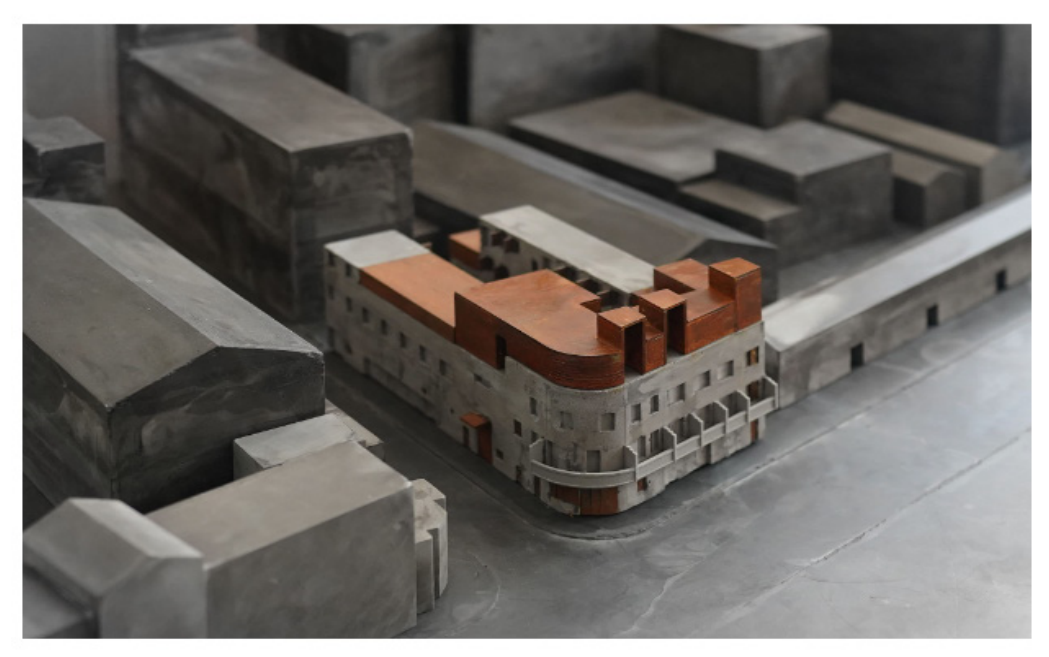
A model of Neri&Hu's The Waterhouse project at the 18th Venice Biennale of Architecture.

The Waterhouse was on Neri's mind as he introduced an installation he created with Hu for the 18th Venice Biennale of Architecture, which opened in May and runs until November 26.