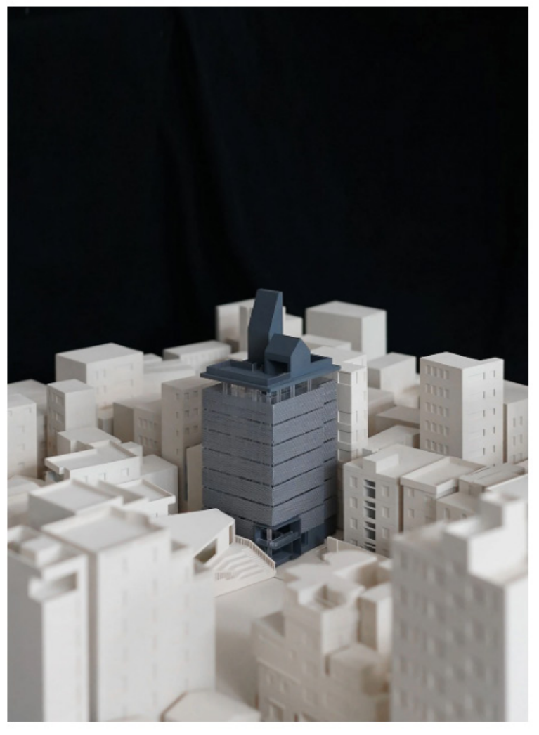
A model of Neri&Hu's Nantou City Guesthouse project at the 18th Venice Biennale of Architecture.

"People visit, and it might be a little rough, it might not be what they imagined a five-star hotel would be, but they like it – even if they aren't able to articulate why," Neri says. "It's a representation of what Shanghai is."