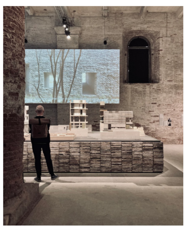
The Neri&Hu installation at the 18th Venice Biennale of Architecture features three models of their adaptive reuse projects sitting on top of a podium made of old Venetian roof tiles.

"There's no such thing as tabula rasa [a clean slate]" even though raze and rebuild is the default mode of development in much of Asia, Neri says.