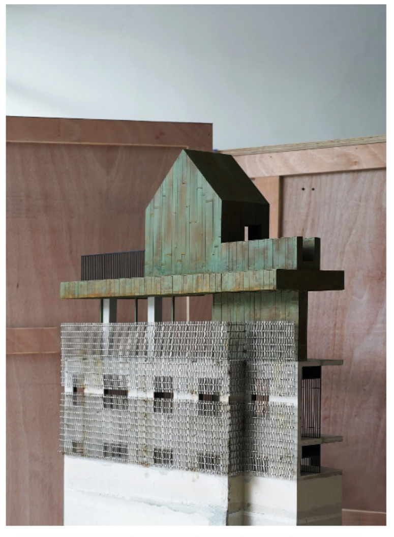
A fragment model of Neri&Hu's Nantou City Guesthouse project at the 18th Venice Biennale of Architecture.

The village is undergoing regeneration and Neri&Hu was hired to transform one of its walk-up tenement buildings.