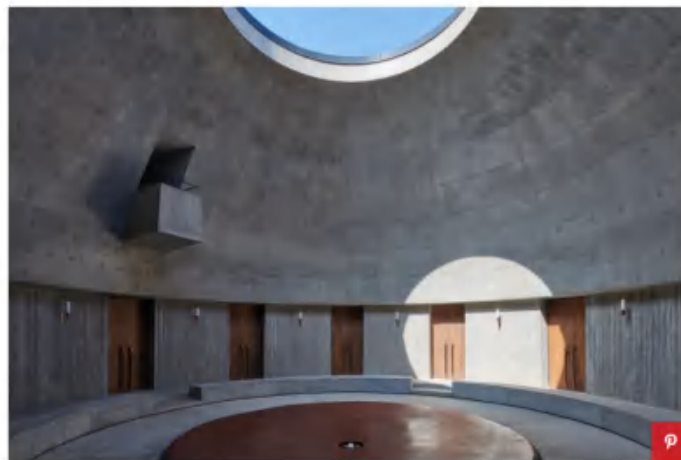
The circular building intended for tastings is a clear tribute to Rome's Pantheon Chen Hao

The two central buildings of the distillery are given a circular and square form, shaped into two precise geometries that, respectively, signify sky and earth in Chinese philosophy. For the former, Neri&Hu have paid homage to Rome's Pantheon, an architecture they also celebrated in the Aranya Art Center . Partially underground, the five halls for tastings face a courtyard where water creates a central staircase passing through the oculus of the dome, which becomes an overarching reference element within the distillery, emerging from the terrain and recreating the silhouette of Mount Emei.