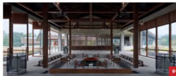
The new distillery designed by Neri&Hu for a French colossal searches for harmony between an Industrial appearance and the visitor experience