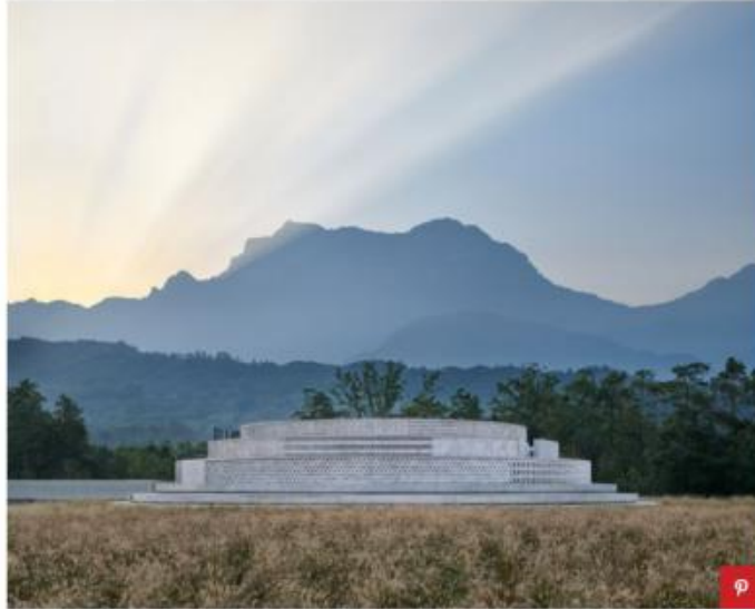
The site hosting the distillery sits at the foot of Mount Emel, one of the most important places in the national culture