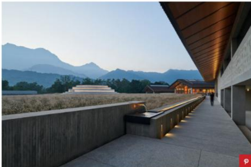
The complex is composed of three buildings with an industrial character and two others – one circular, one square

The complex of the distillery is composed of multiple buildings, with industrial spaces embracing a modern interpretation of China's vernacular architecture , accompanied by two other volumes destined to welcome visitors through various experiences within the world of spirits. To host the whisky production plants are three long buildings situated along the north end of the lot, softly accompanying the natural slope. Respecting the vernacular architecture, the external appearance of the buildings recalls that of tradition thanks to sloping rooftops made with reclaimed clay shingles resting on a contemporary structure in reinforced concrete. With a vision to recover and through the lens of a cycle of destruction and reconstruction, the creatives organized supporting walls to be realized with materials extracted from the terrain while leveling the lot.