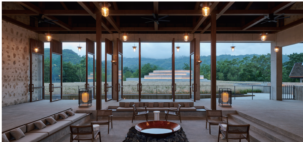
从接待大厅眺望体验中心 Overlooking experience center from main lobby