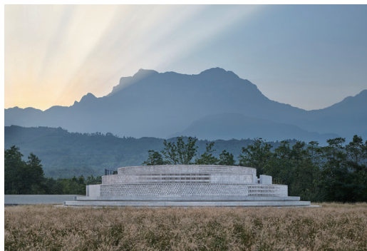
体验中心外观 External view of experience center