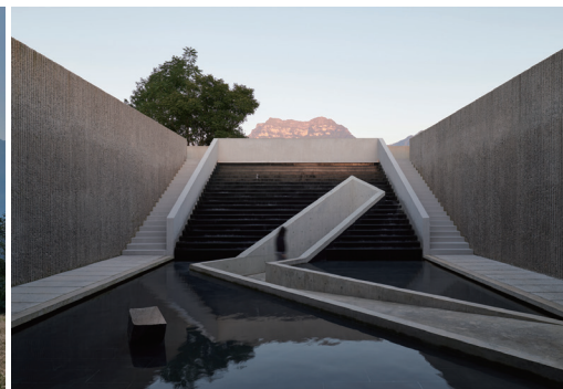
水景庭院 View of water courtyard