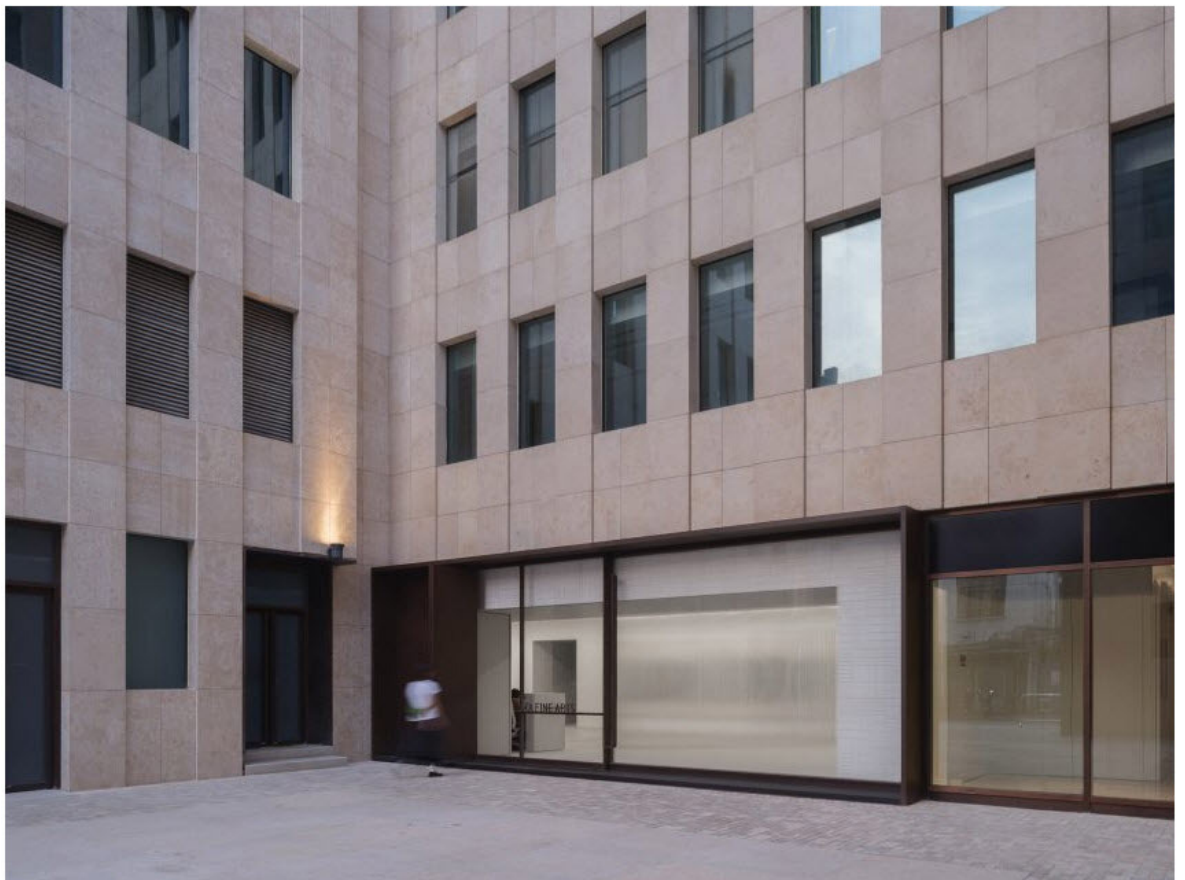
The facade of the gallery is framed in aged steel to contrast the contemporary gallery

“This deepened threshold condition found on both facades defines the visitor’s arrival sequence and journey within.”