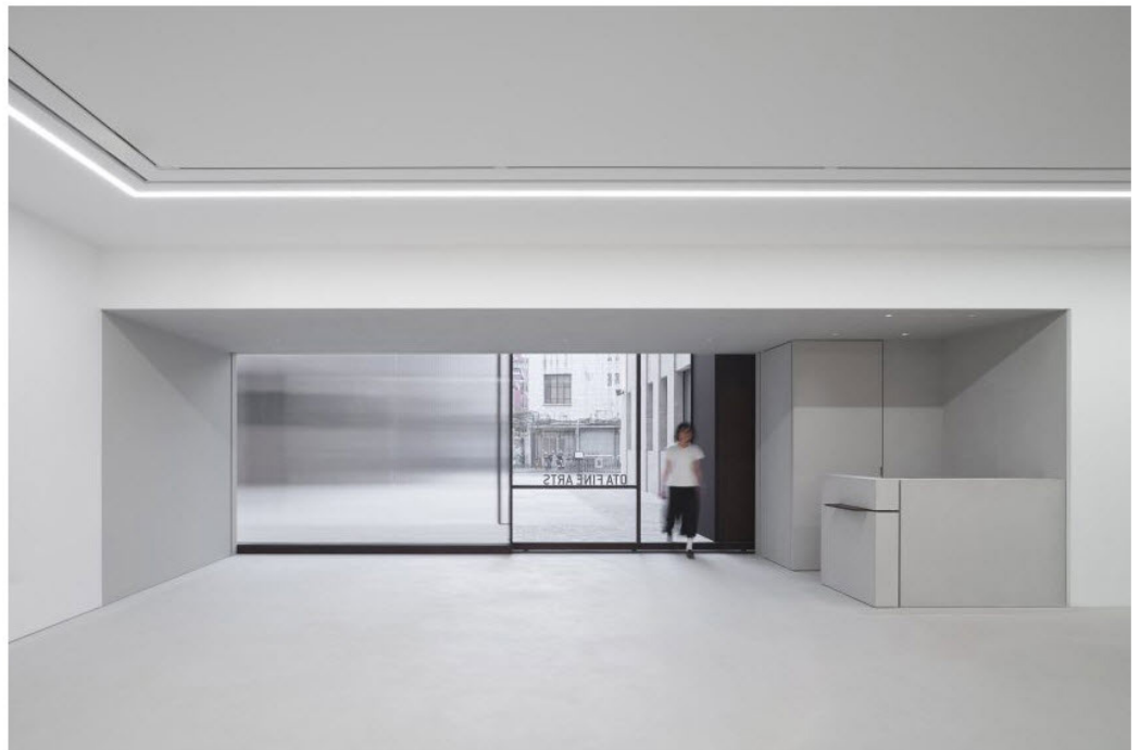
A warehouse-sized door can be fully open on the west facade for easy transport of large art pieces

Handmade ivory tiles line the inner side of the window in a subtle woven pattern, serving as a neutral backdrop for the art pieces.