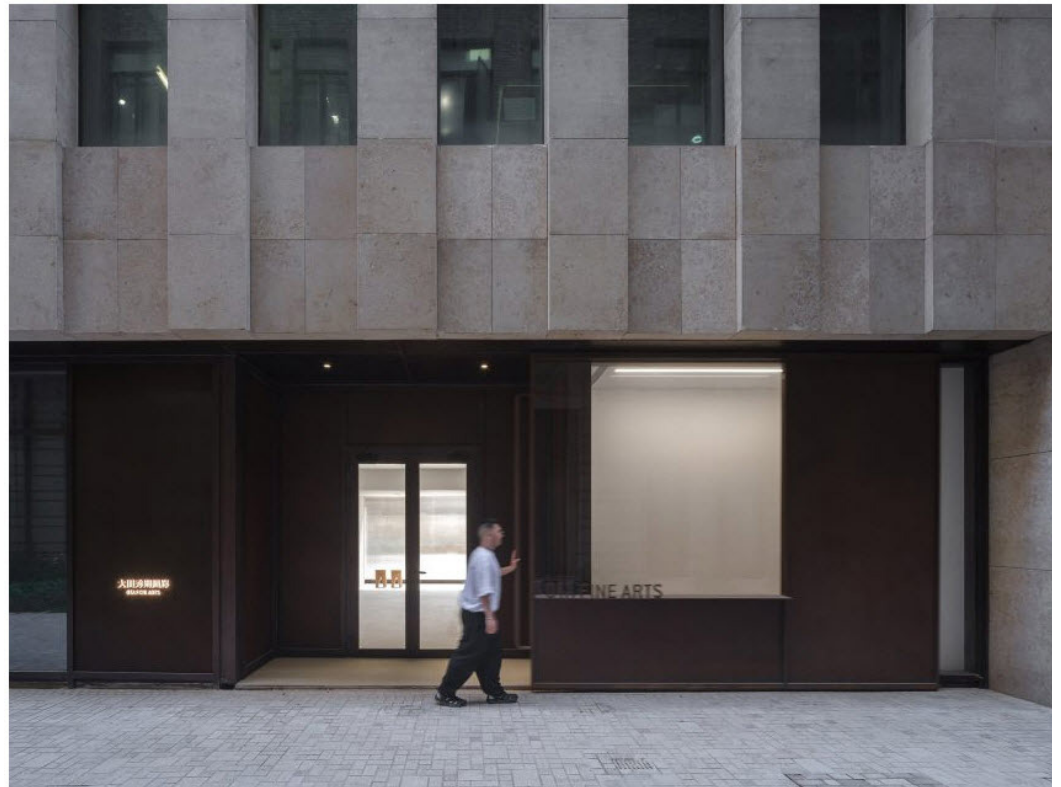
The entrance of the gallery features an oversized sliding door

The gallery sits on the ground floor of a mixed-use tower at Rockbund, a development amidst the historical Bund in Shanghai along the Huangpu River, where a series of restored colonial art deco buildings are located.