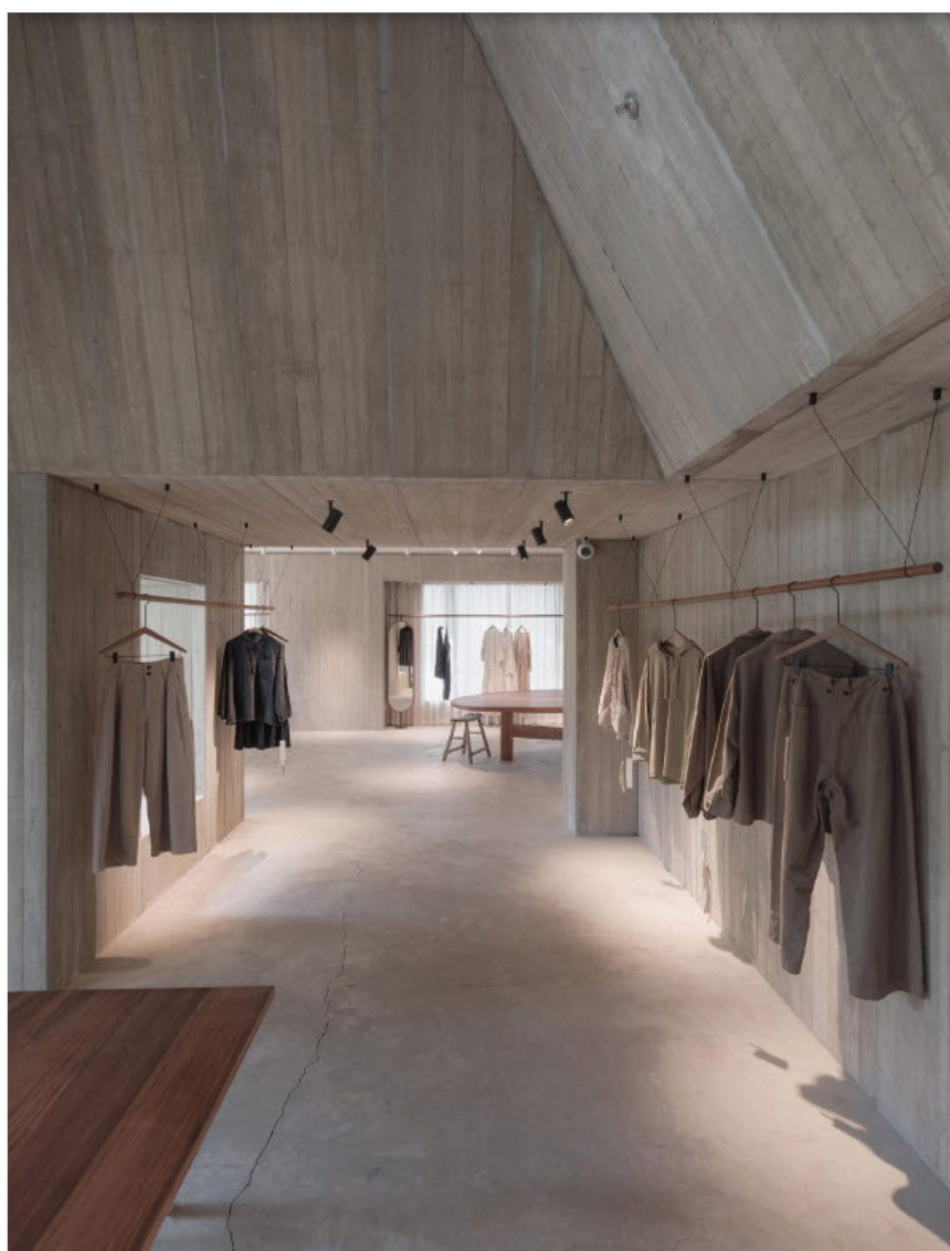
Linen and walnut wood contrast the concrete in Woven Moonlight

A double-pitch sloped ceiling was clad with the same concrete as the walls. Skylights on the ceiling, as well as full-height glass windows on one side, fill the space with plenty of natural light.