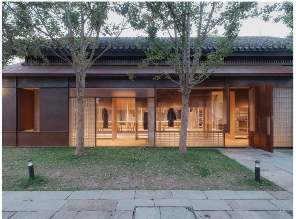
Neri&Hu has designed two adjacent stores in Shanghai

The two adjacent stores are located at Panlong Tiandi development in Shanghai. One was designed for Jisifang Boutique and the other for its sister brand Woven Moonlight, also owned by Jisifang.