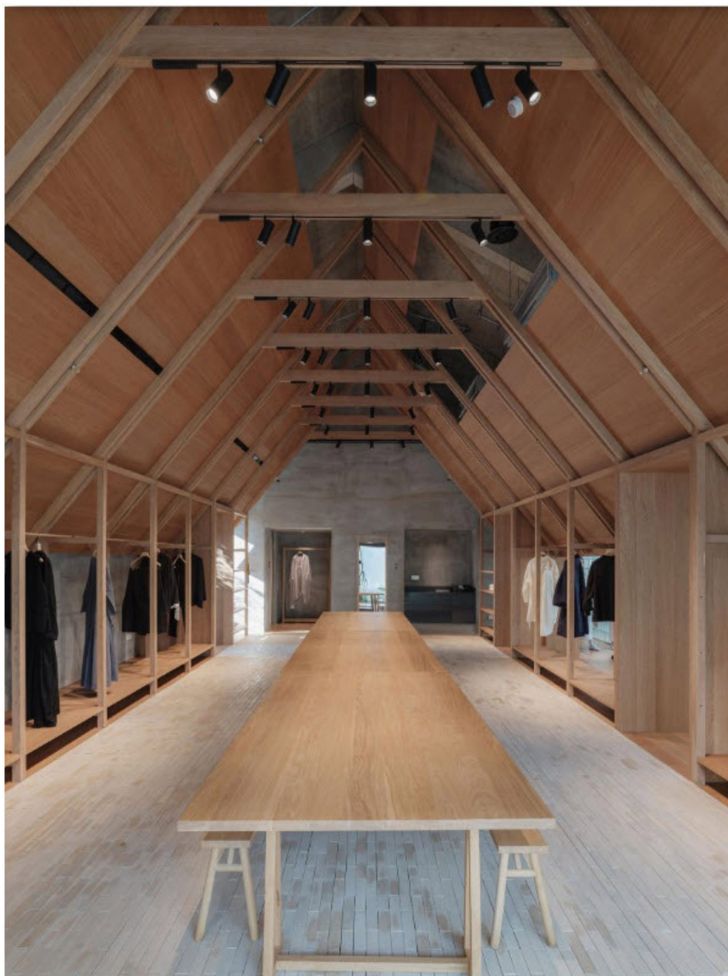
A wooden house structure was inserted into Jisifang Boutique

A wooden house was inserted into the 110-square-metre Jisifang Boutique, the sloping roof of which takes advantage of the full height space to create a “spacious sanctuary”, the studio said.