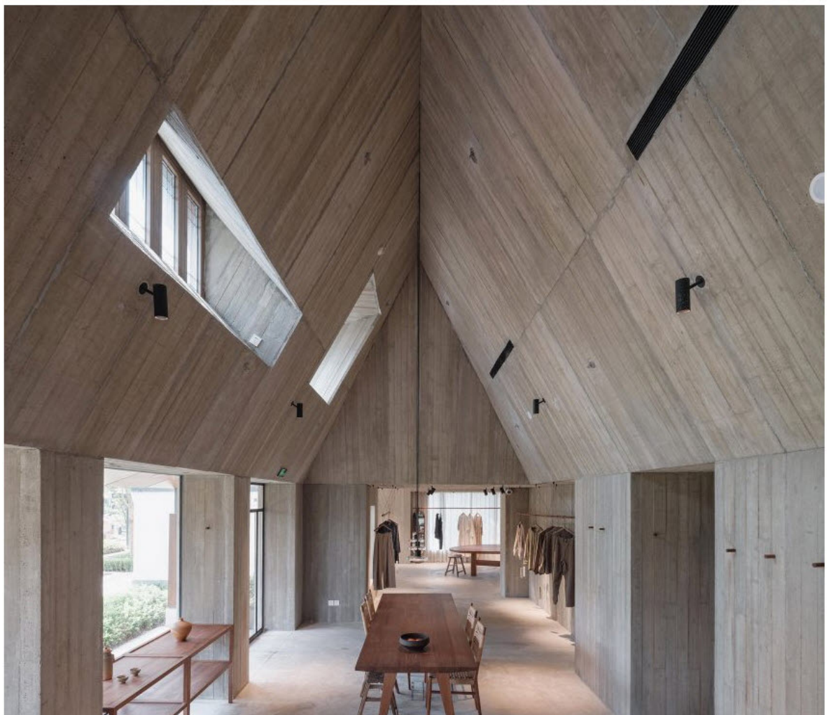
The Wooven Moonlight store features a double-pitch sloped ceiling clad with concrete

“We hope that when people touch the linen fabric of Jisifang, their mood and spirit may transcend the urban environment, back to nature,” it continued.