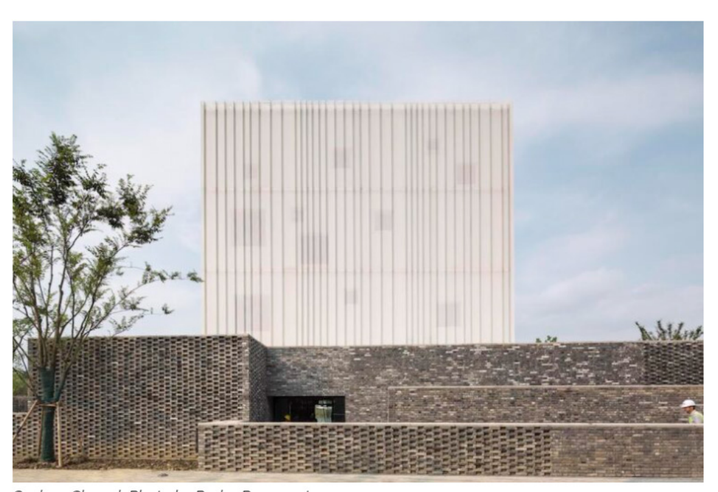
Suzhou Chapel. My favorite period in design is...

Lyndon: The beginning, during schematic when we are shaping the forms.